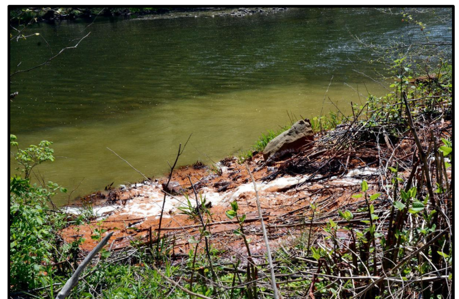
Figure 2. Image of Tenmile Creek near the town of Fredericktown, PA showing iron from acid mine drainage.

The drinking water limits for radionuclides include the combined radium 226/228 limit of 5 picocuries per liter (pCi/L) and gross alpha particle limit of 15 pCi/L. Pennsylvania DEP reported radium reaching levels in the range of 102 and 301 pCi/L. 3RQ sampled several sites along Tenmile Creek and had a maximum reading of 2.95 pCi/L for radium. The average values reported were 0.74 pCi/L. Both the average and maximum fell below the drinking water standard. The only parameter near the drinking water limit from 3RQ's sampling was the gross alpha radiation reading of 13.4 pCi/L. PADEP subsequently has repeated their sampling and also concluded that radiologicals were not a concern. It is believed that the initial high levels reported by the DEP were due to method and reporting errors. 3RQ's water quality expert Dr. Paul Ziemkiewicz commented on this site saying, "The radium numbers were high but not consistent with the much lower gross alpha radiation readings. Radium is an alpha emitter and the gross alpha reading should be the sum of all of the alpha emitters."