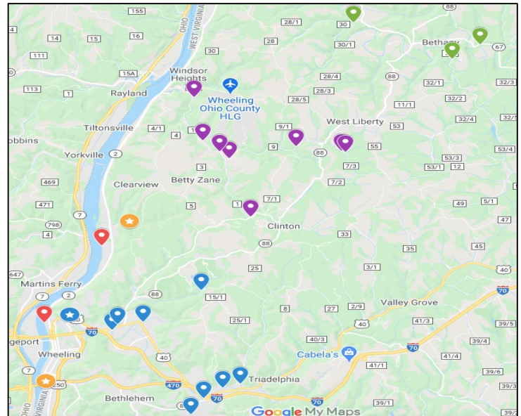
Figure 1. The twenty-four sampled sites in the Upper Ohio River watershed near Wheeling, WV. Site markers are as follows: Blue – Wheeling Creek and tributaries; dark orange – Short Creek and tributaries; green – Buffalo Creek and tributaries; red – Ohio River; orange-direct tributaries to the Ohio River; stars indicate AMD impacted sites.

Twenty-four sites were chosen for analysis that had been monitored weekly by EES lab in the Upper Ohio River watershed near Wheeling WV. (figure 1.). Some of the sites are on relatively healthy streams like Wheeling and Buffalo Creeks, while other sites are heavily impacted by acid mine drainage (AMD). Water temperature and SpC was measured with a calibrated YSI QuatroPro field meter as part of our normal monitoring that began as in 2018. The researchers defined "summer" as ranging from June 1 st to September 30 th . Wilcoxon Signed Range tests (similar to a T-tests) was used to determine if water temperature and SpC were significantly different between summer 2019 and summer 2020.